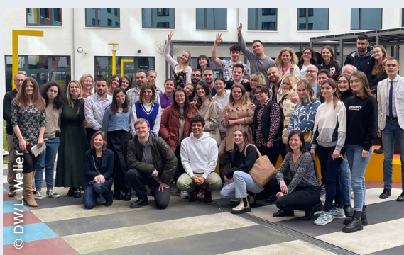
Participants in DW Akademie's CINergy project

In times of aggressive disinformation campaigns in Eastern Europe and the Balkans, innovative and new ways to provide the public with reliable facts are becoming increasingly important. DW Akademie’s CINergy project brought together young, creative people from the media sector, e.g. influencers, fact checkers, journalists or employees of non-governmental organizations, along with academics from the media sector or other experts, to jointly develop media products. The goal was to develop and communicate new, constructive narratives through innovative distribution channels. They were supported by mentors who assisted them in developing their ideas. In the end, three innovative fact-based approaches emerged that connected people/communities across countries or regions and were published to counteract disinformation. An example: the project Democracy in Danger told stories of people affected by totalitarian regimes in the past or present.