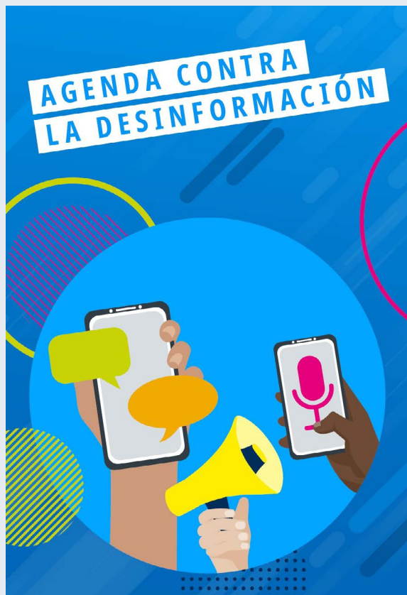
Banner of the "Agenda against Disinformation" facilitated by DW Akademie in Latin America

The rise of left- and right-wing populist actors in Latin America has fuelled polarization and acted as a catalyst for disinformation, especially on social media. DW Akademie facilitated digital encounters between 24 experts from academia, media and civil society from 20 organizations to develop an “Agenda against Disinformation” in Latin America. In four multidisciplinary and cross-sectoral analysis groups they discussed mechanisms, trends and knowledge gaps, focusing on the particularities in the Latin American context. The resulting findings and practical recommendations served to inform organizations, donors and decision makers on the current requirements in the fight against disinformation in the region.