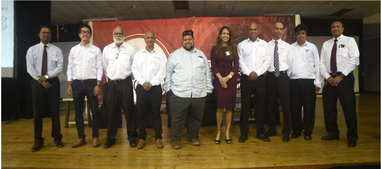
TTMAG Board of Directors